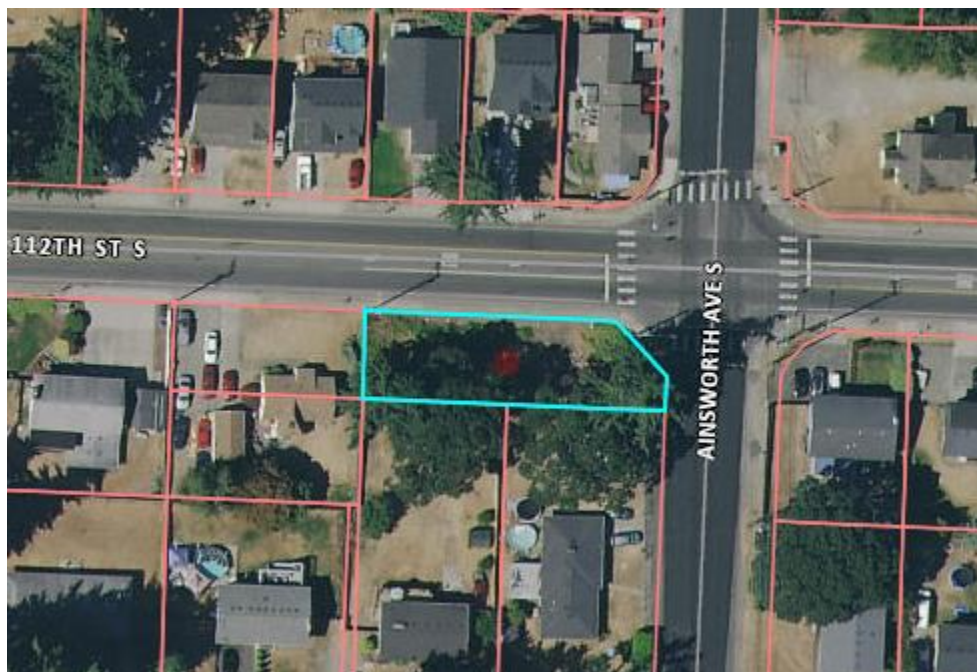
Figure 1: Project will be occurring on the highlighted parcel.