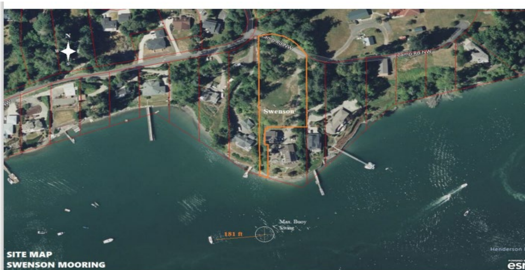
SITE MAP SWENSON MOORING

Buoy Position: 47.32587 N lat. -122.66320 W long.