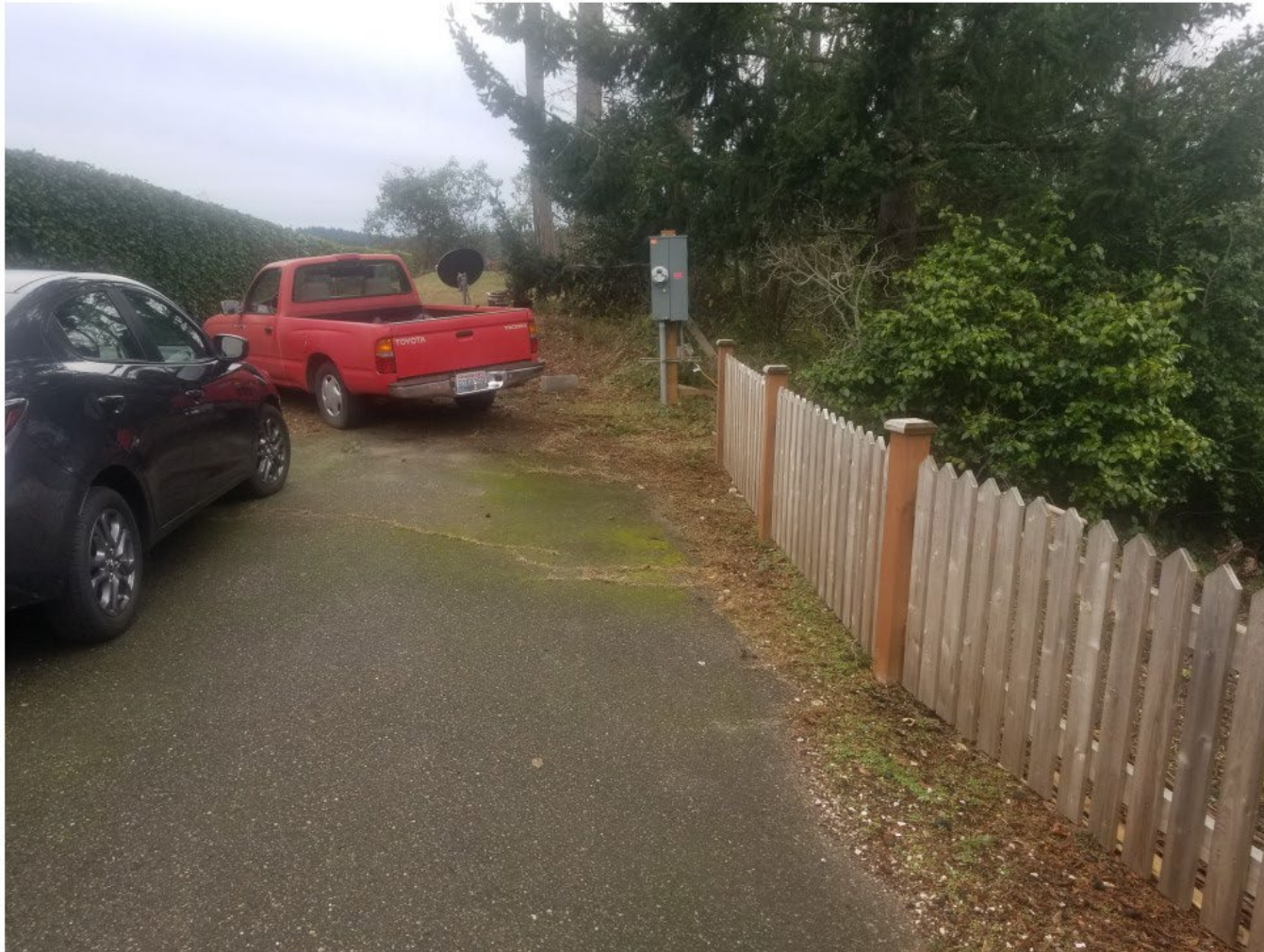
Applicant Provided Site Photos