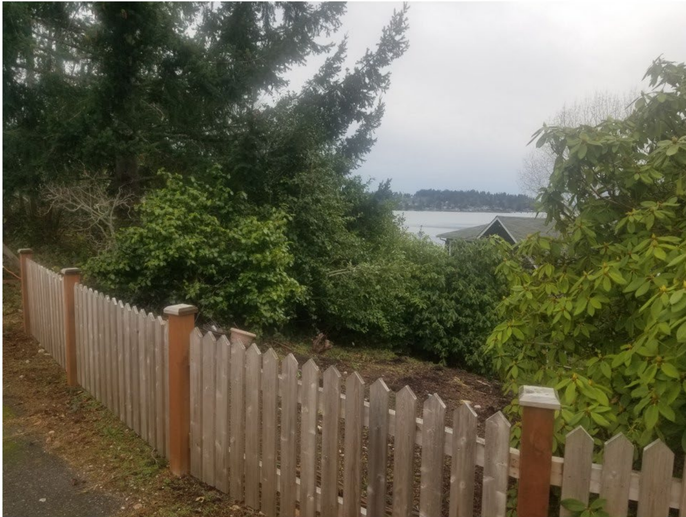
Applicant Provided Site Photos