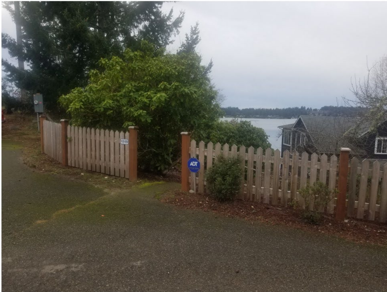
Applicant Provided Site Photos