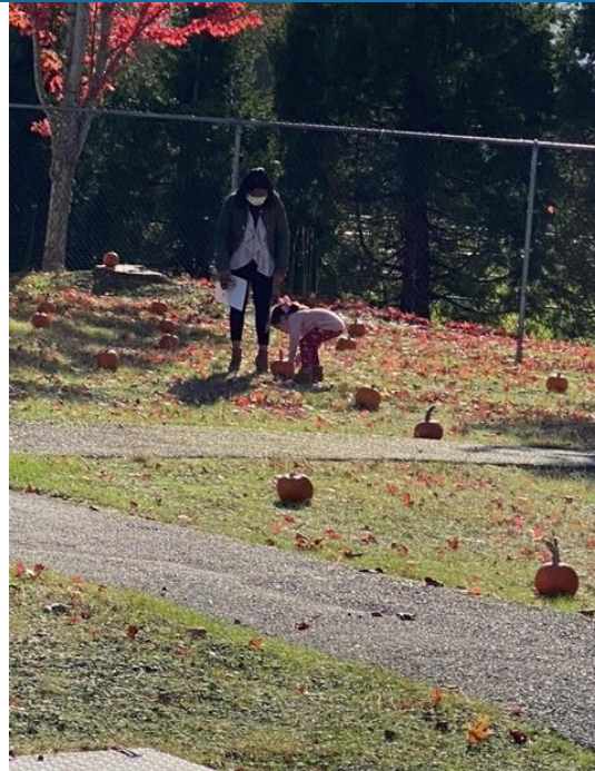
The search for the perfect pumpkin!