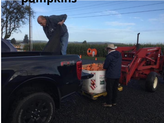
Volunteers donating and loading pumpkins