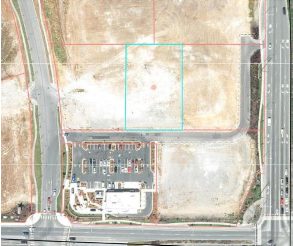
Figure 1: Project highlighted.